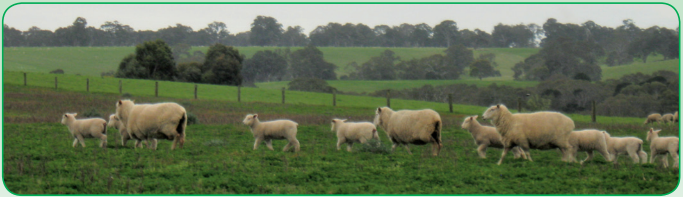
Romney cross ewes and lambs at Craig Grant's, September 2011

High performance on low rainfall "fine wool" country. Craig & Jacinta Grant, together with Craig's parents Colin & Beryl, farm 5000 ewes and a 220 cow Murray Grey Stud at Pigeon Ponds, northwest of Hamilton.