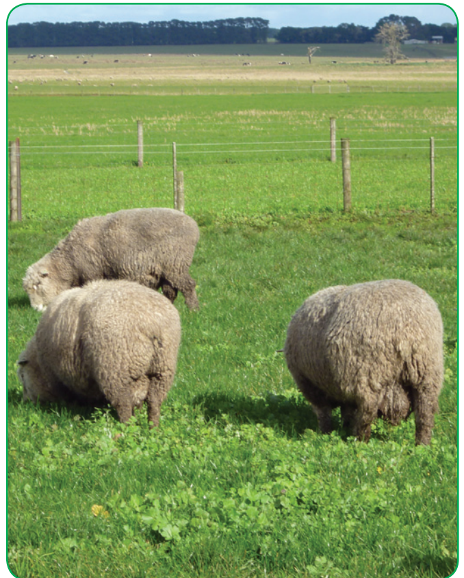
Wairere Romney rams at Richie Belleville's property showing depth and width of hindquarter which complements the typical long, tall, lean Australian body type.