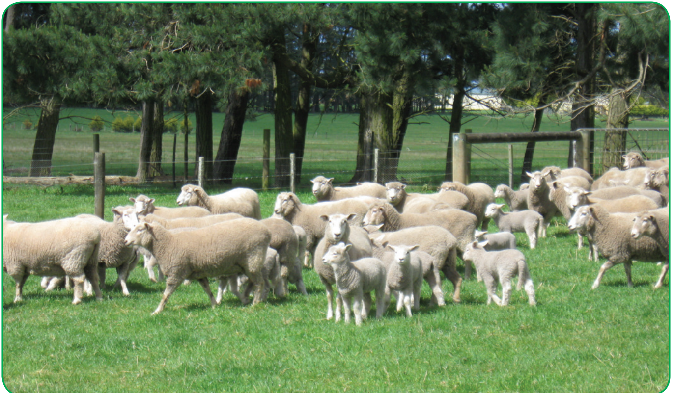
Wayne Dodson's fourteen month old Wairere/BorderMerino ewe hoggets with 150% lambs at foot, September 2011.

Wairere has had a policy of mating all ewe hoggets since 1966, and lambing them unshepherded. Since 2004 around 2,500 hoggets have been mated each year and only these which get in lamb are retained, usually around 1900 (one exception in 2009, 140 dry hoggets were retained). These Romney hoggets at mating average around 40kg net of wool at 7½ months old.