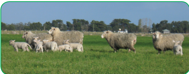
Wairere/Border cross ewe hoggets at Ewan Price's, September 2011

Wairere's reputation. Over the past eight years Wairere has averaged sales of 4,500 rams per year. The Romney is the dominant breed in New Zealand. The Coopworth (half Border Leicester/half Romney) suits good country, which is increasingly going to dairying. The trend to composites (Finn, Eastfriesian, Texel) has been followed by a strong trend back to Romneys over the past five years.