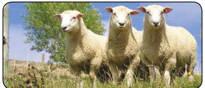
Wairere TefRom ram lambs, February, aged 5-6 months